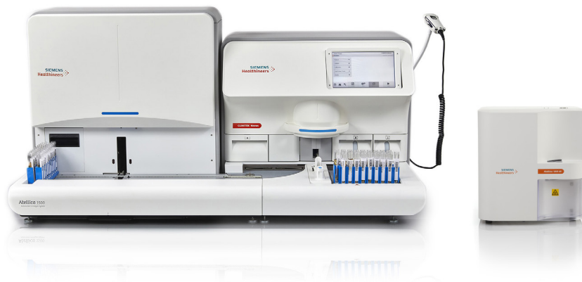
Atellica 1500 Automated Urinalysis System†