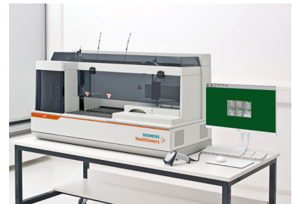
BN™ II System