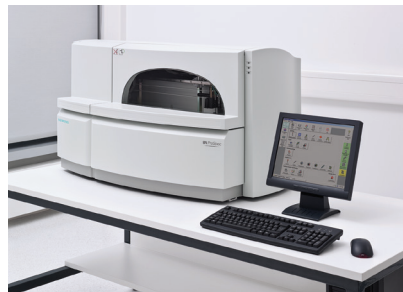
BN ProSpec® System